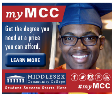
Online Tile Ad